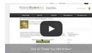
How To Create An FSA ID