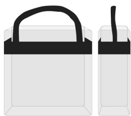
12" x 12" x 6" Clear Tote Bag