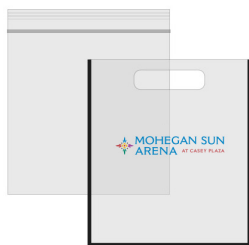
11" x 11" x 0" Flat-Seamed One-Gallon Plastic Bag