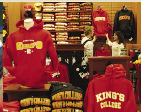
Get your spirit gear

King's Barnes & Noble College Bookstore is your one stop shop for not only textbooks, dorm supplies and King's apparel, but you can also find a quiet spot to study or get together with friends while enjoying a full menu of Starbucks specialities in the bookstore's spacious café. Although the bookstore is located just a few short blocks from campus, King's does offer free shuttle service from the campus to and from the bookstore.