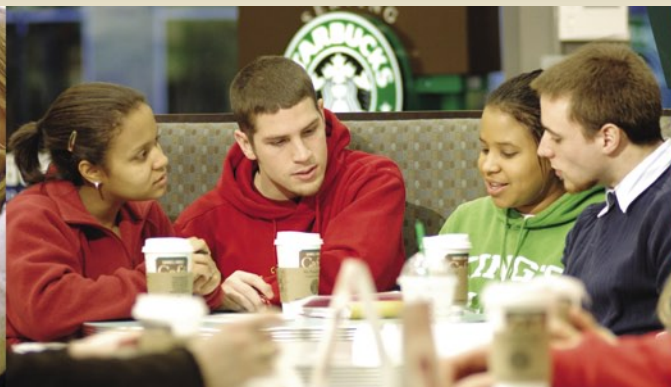
Meet up with classmates to study