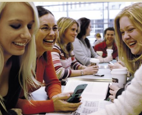
Socialize with friends